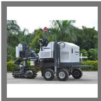
SlipForm Kerb Paver