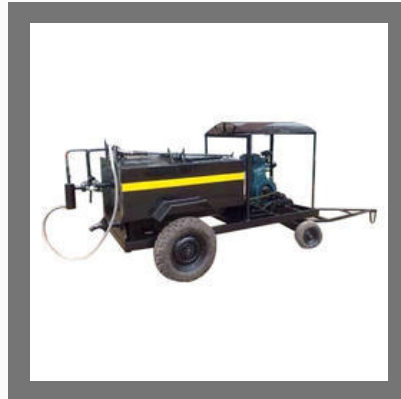
Bitumen Sprayer Machine