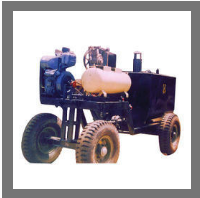
Bitumen Boiler Cum Sprayer Machine 1.5 & 2.5 Ton