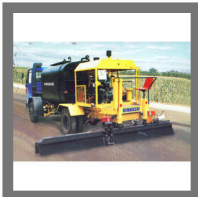
Bitumen Pressure Distributor