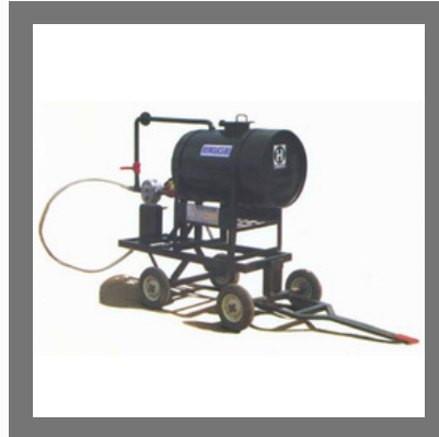
Fog Seal Sprayer Machine-200 Lit