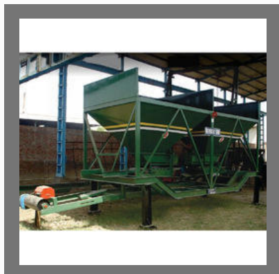
Drum Mix Plant-35 To 90 TPH