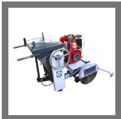
Asphalt / Concrete Cutter