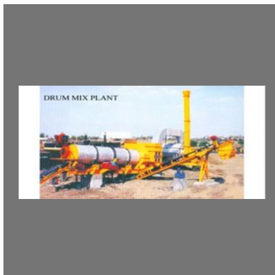
Asphalt Drum Mix Plant-35 To 90 TPH