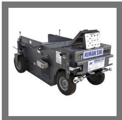
Kerb Casting Paver Machine- Model HIM-KP 40