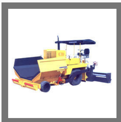
Asphalt Paver Finisher